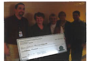
LMH Auxiliary donated $15,000 to the Hospital this year.

The Ministry of Health and Long Term Care provides 90% of the cost of new construction or approved renovations and rarely funds the purchase of new equipment. Therefore, hospital surpluses or local fundraising are required in order to purchase new equipment for our hospitals. The Listowel Memorial Hospital Foundation, Wingham and District Hospital Foundation, the Listowel Memorial Hospital Auxiliary and the Wingham and District Hospital Auxiliary will continue to play an important role in equipping our Hospitals. Donations are directed towards patient care for equipment and supplies. Thank you to the numerous volunteers who generously dedicate their time to support our hospitals and thank you to the staff and the community for your continued support.