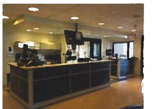
Physician and Nursing station at WDH Emergency Department

Staffing an emergency department 24 hours a day, 7 days a week can be challenging for our small number of medical staff. In Wingham, 6 physicians cover 65% of the 24 hour shifts. The remaining shifts are staffed by physicians from other communities that come for a day or two. In Listowel, 7 physicians cover 80% of the 12 hour shifts with locum or visiting physicians staffing the remaining 20%. Last year more than 13,000 people visited the Listowel emergency department and over 11,000 patients were seen in Wingham. On arrival patients are assessed by a nurse and those who are the most sick are given priority. Please bring all of your medications with you when you come to the hospital for medical care because it helps the medical staff determine the best course of treatment for you. Patients are reminded that if you need non urgent advice call: Telehealth at 1-866-797-0000. If it is an emergency or you need an ambulance call 911.