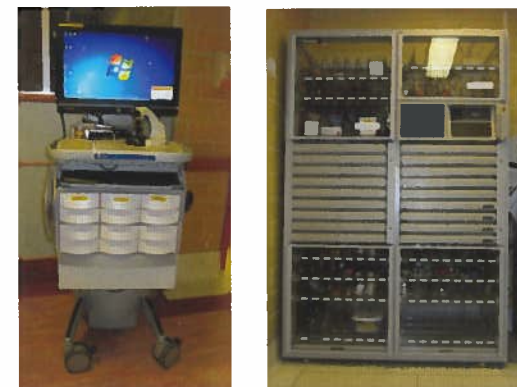
Electronic Medication Carts and Cabinets

This was a complex project that needed to accommodate a drug list that includes thousands of medications and 10 hospitals of various sizes. There have been some 'bugs' to work out of the system and changes continue to be made to make improvements.