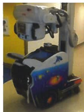
New Portable X-Ray Equipment doesn't require movement of patient

A single portable x-ray machine costs close to $200,000, which is typically not funded by the Ministry of Health and Long Term Care. Fundraising efforts are critical to our being able to purchase this up to date equipment.